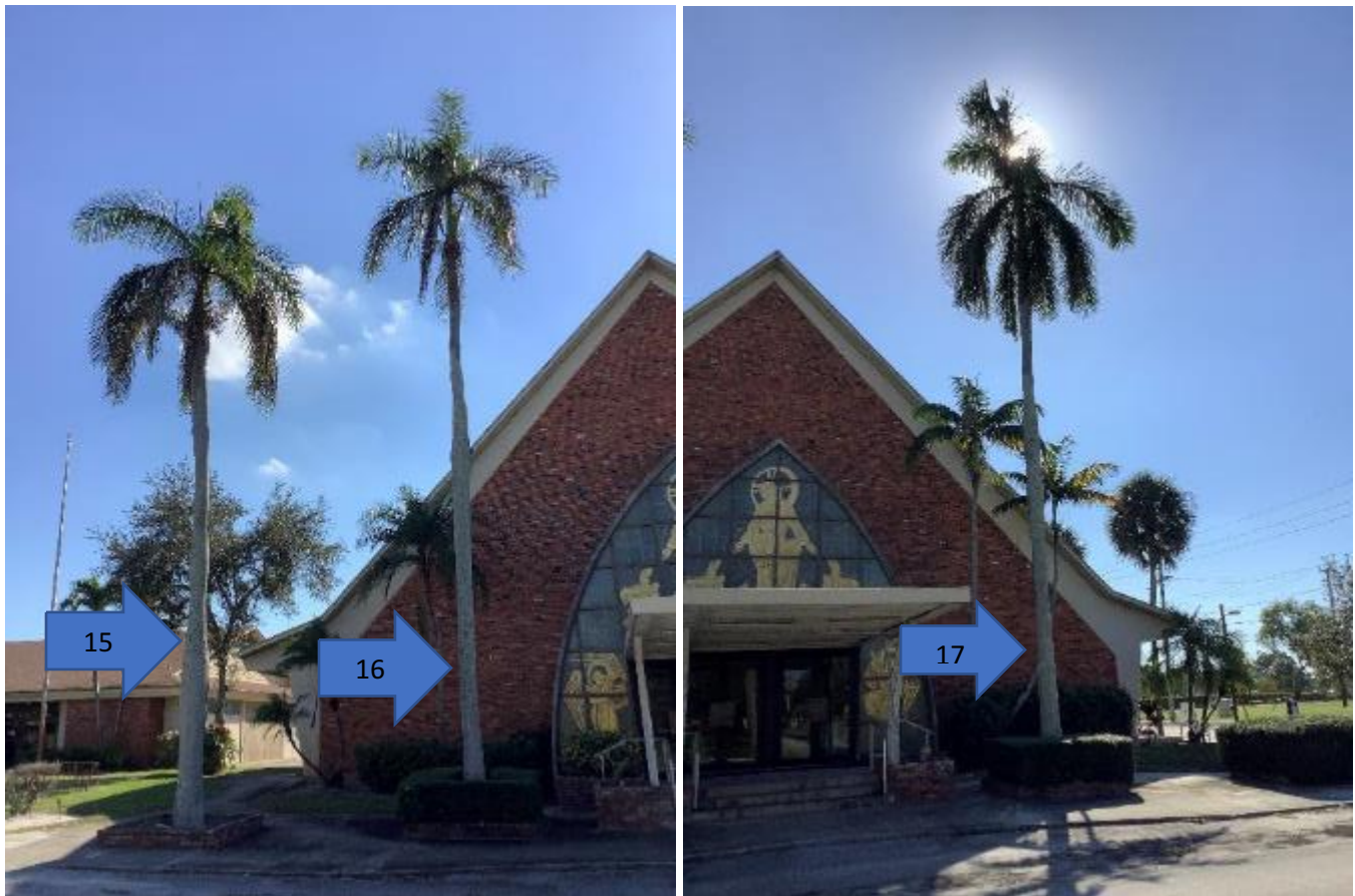
Royal Palms ( Roystonea elata ), facing south. Note nutrient deficiencies and pencilling.