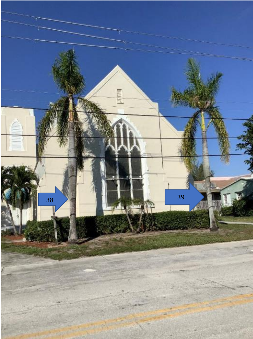
Royal Palms ( Roystonea elata ), facing north. Note significant utility pruning.

Jeremy T Chancey, Consulting Arborist 1323 Southeast 17th Street, #201 Fort Lauderdale, Florida 33316 c 954 612 2500 jeremytchancey@gmail.com