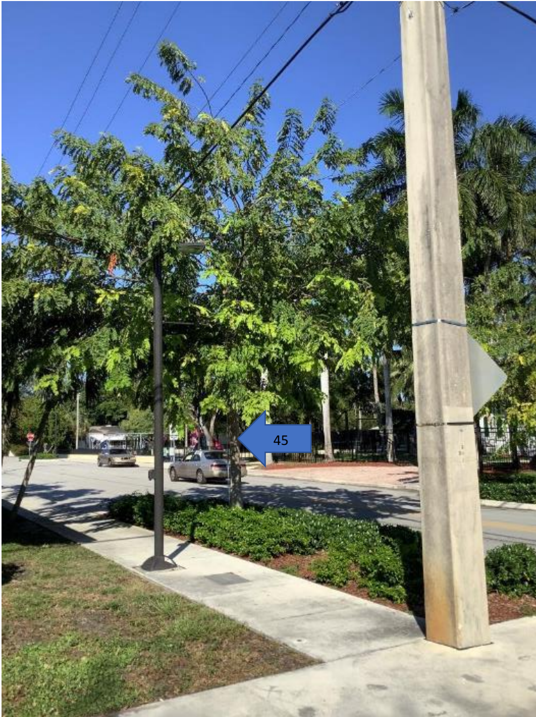
Pink Shower ( Cassia javanica ), facing north. Note nutrient deficiencies and bracing pole.

Jeremy T Chancey, Consulting Arborist 1323 Southeast 17th Street, #201 Fort Lauderdale, Florida 33316 c 954 612 2500 jeremytchancey@gmail.com