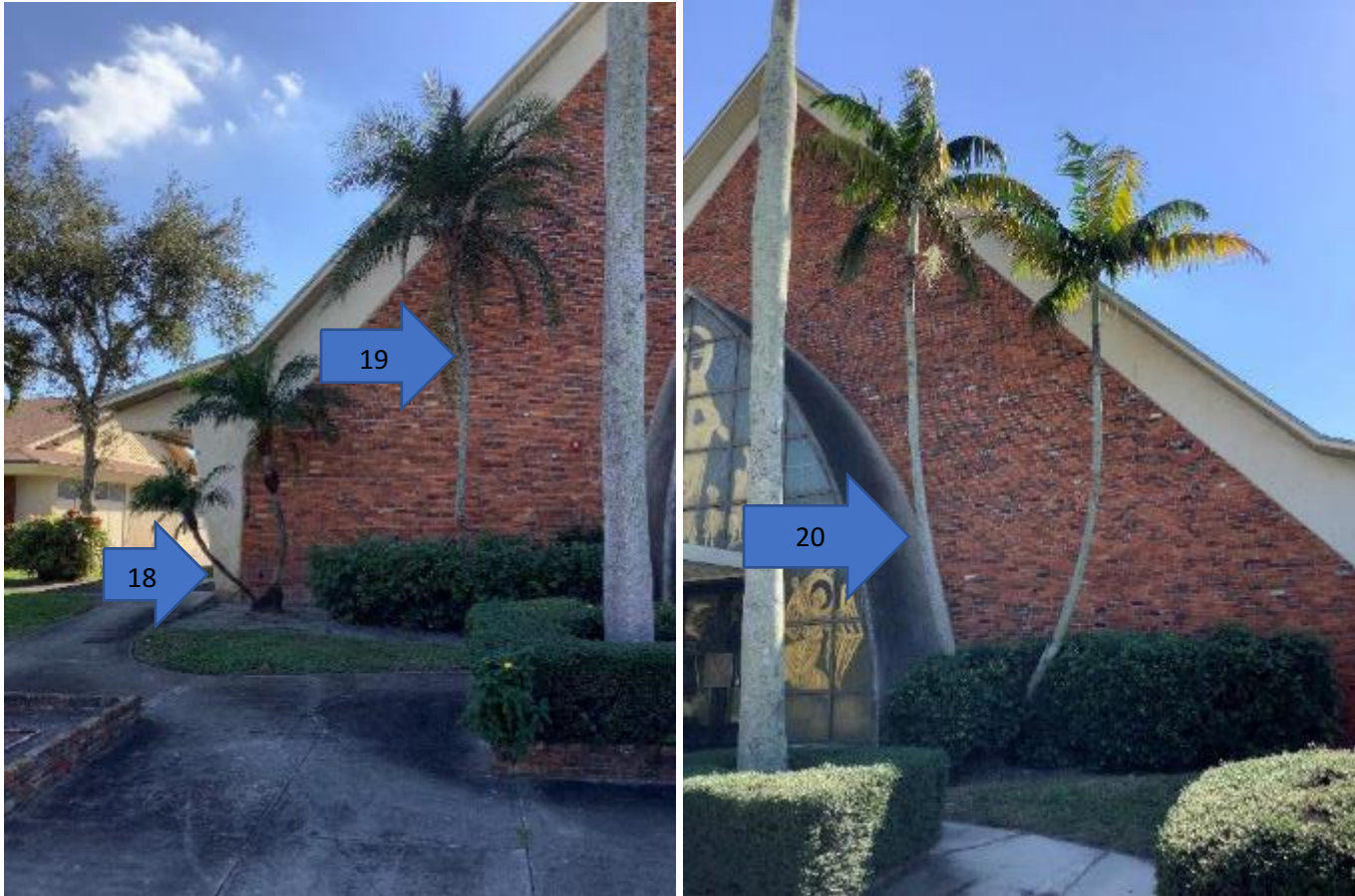
Pygmy Date Palm ( Phoenix roebelenii ) Tree #18, Senegal Date Palm ( Phoenix reclinata ) Tree #19, and Montgomery palm ( Veitchia arecina ), facing south. Note nutrient deficiencies.