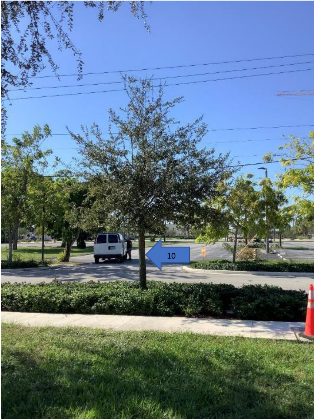
Live Oak ( Quercus virginiana ), facing west.