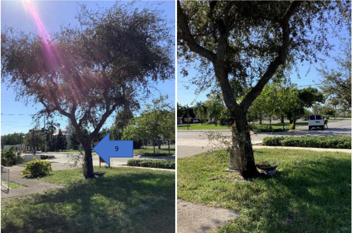
Live Oak ( Quercus virginiana ), facing south. Note poor structure, confined root space, and flush cuts.

Jeremy T Chancey, Consulting Arborist 1323 Southeast 17th Street, #201 Fort Lauderdale, Florida 33316 c 954 612 2500 jeremytchancey@gmail.com