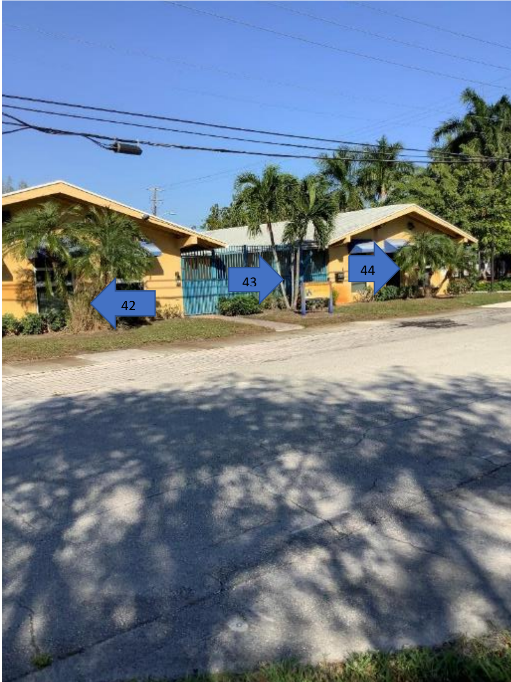
Pygmy Date Palms ( Phoenix roebelenii ) Trees #'s 42 & 44, and Christmas Palm ( Adonidia merrillii ) Tree #43, facing north.