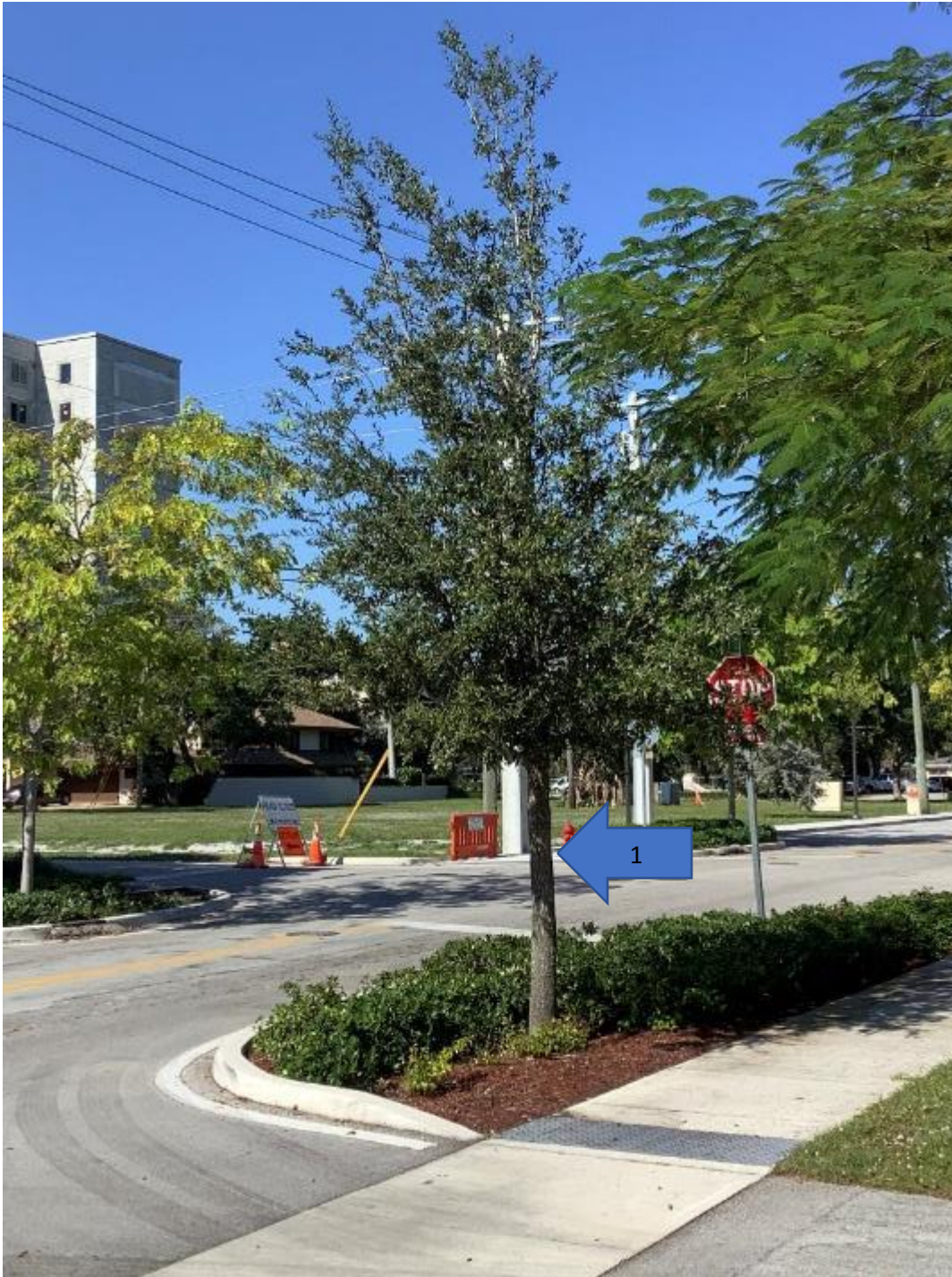
Live Oak ( Quercus virginiana ), facing north.