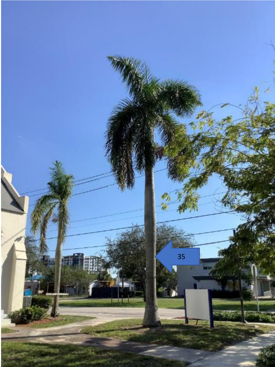
Royal Palm ( Roystonea elata ), facing south.