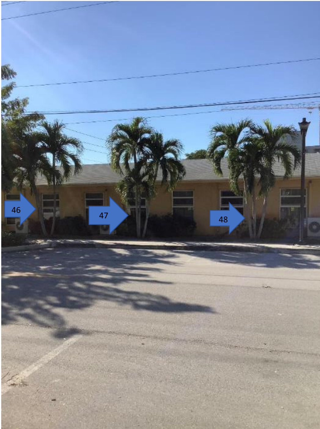
Christmas Palms ( Adonidia merrillii ), facing west.