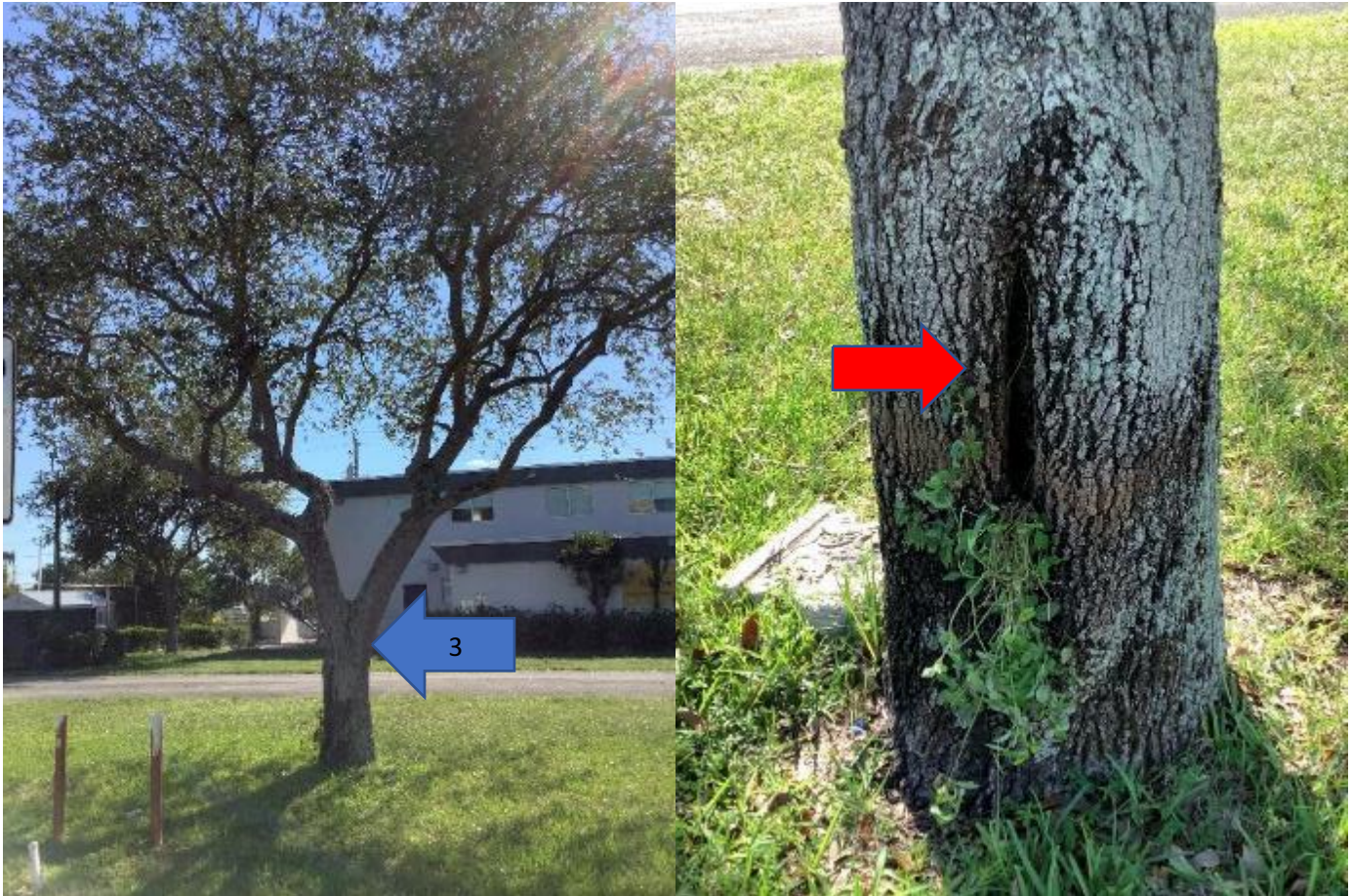
Live Oak ( Quercus virginiana ), facing south. Note poor structure, over lifted canopy, trunk wound (red arrow), and visual evidence of decay.

Jeremy T Chancey, Consulting Arborist 1323 Southeast 17th Street, #201 Fort Lauderdale, Florida 33316 c 954 612 2500 jeremytchancey@gmail.com