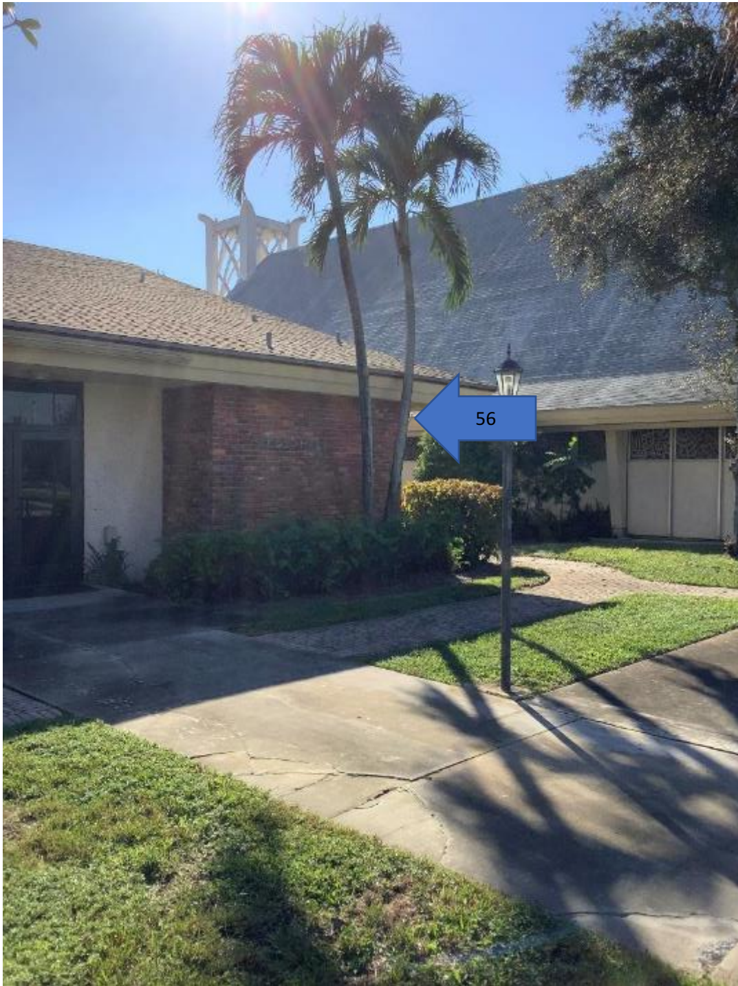
Christmas Palm ( Adonidia merrillii ), facing south. Note nutrient deficiencies.