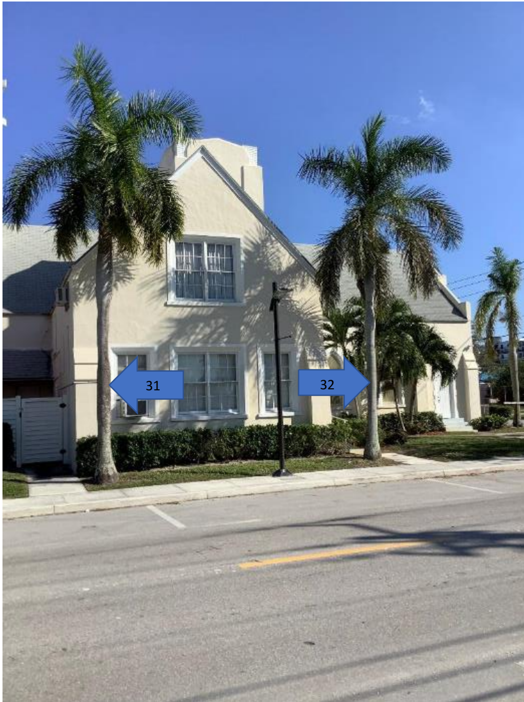
Royal Palms ( Roystonea elata ), facing east. Note nutrient deficiencies.