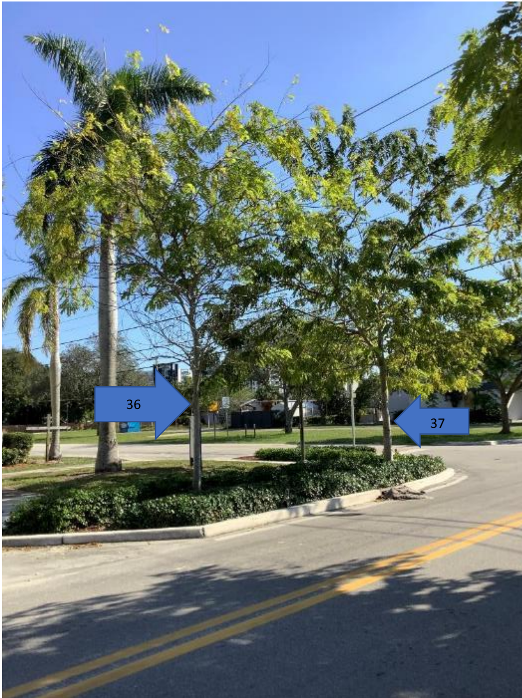
Pink Shower Trees ( Cassia javanica ), facing east. Note canopy dieback for Tree #36.

Jeremy T Chancey, Consulting Arborist 1323 Southeast 17th Street, #201 Fort Lauderdale, Florida 33316 c 954 612 2500 jeremytchancey@gmail.com