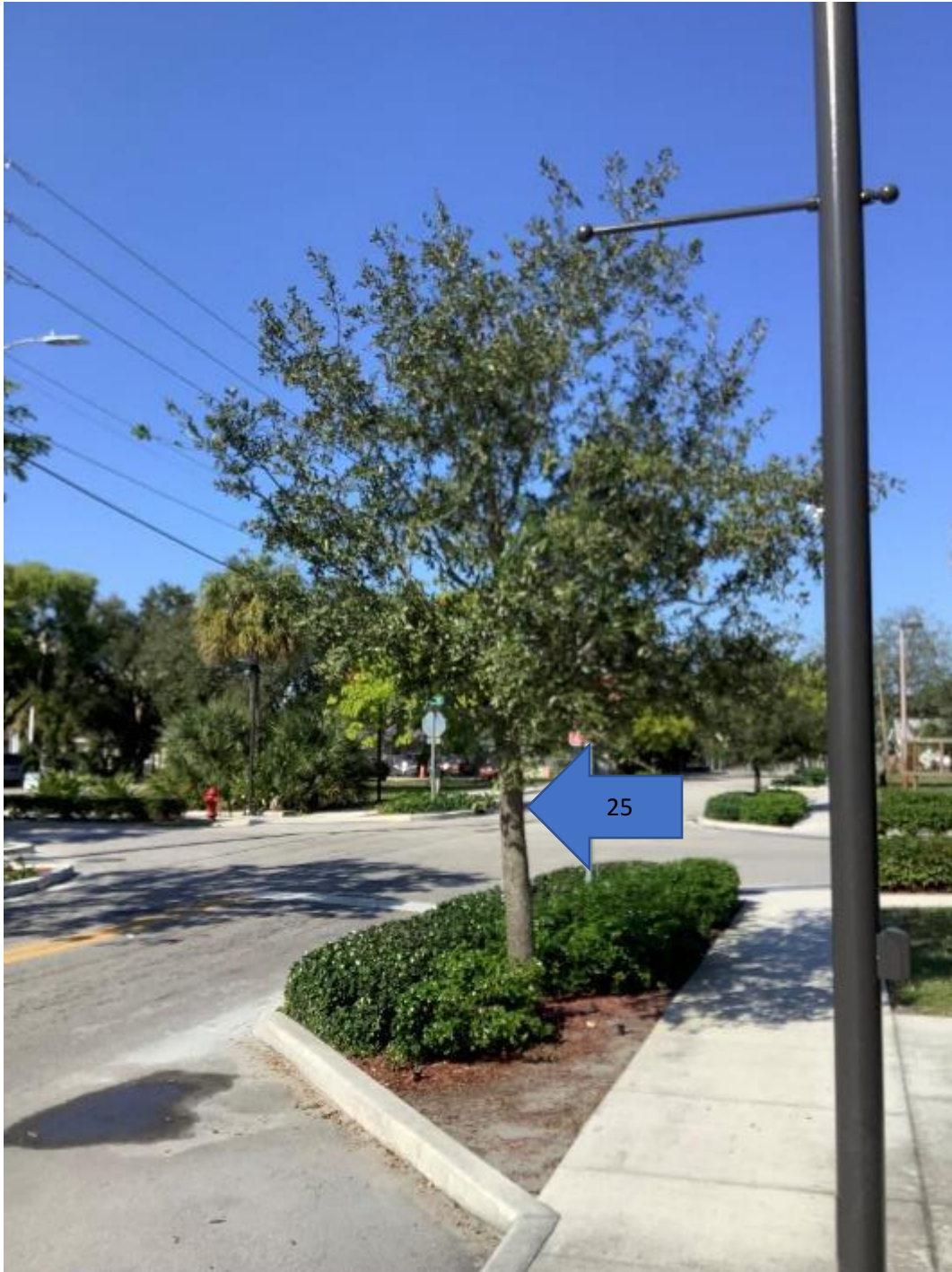
Live Oak ( Quercus virginiana ), facing north.