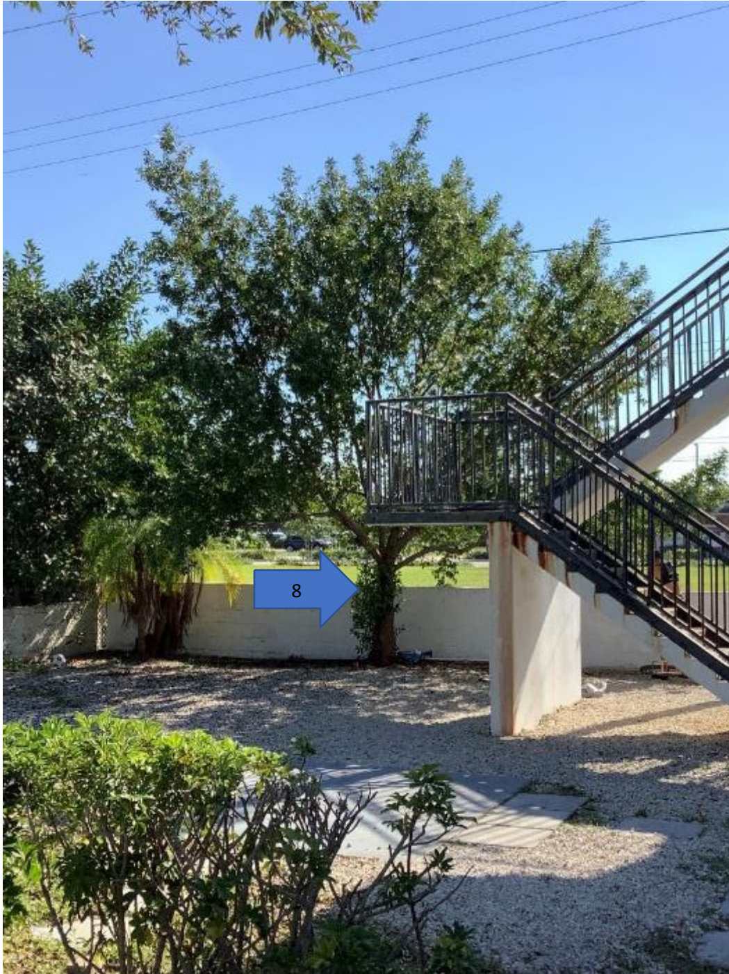
Green Buttonwood ( Conocarpus erectus ), facing south. Note severely confined root space.

Jeremy T Chancey, Consulting Arborist 1323 Southeast 17th Street, #201 Fort Lauderdale, Florida 33316 c 954 612 2500 jeremytchancey@gmail.com