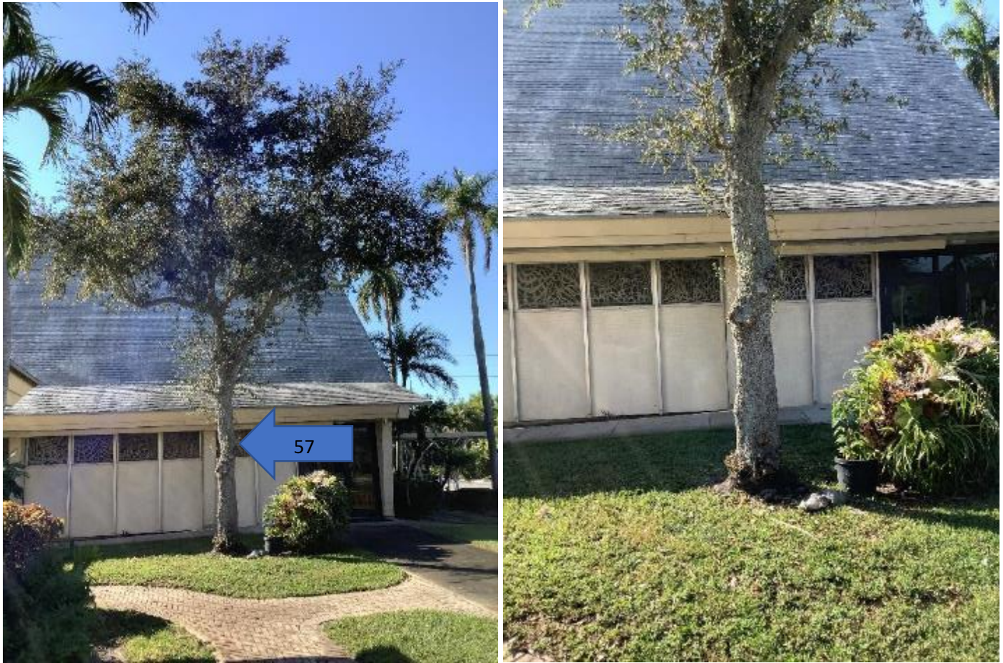
Live Oak ( Quercus virginiana ), facing west. Note poor structure, water sprouts, flush cuts, and confined root space.

Jeremy T Chancey, Consulting Arborist 1323 Southeast 17th Street, #201 Fort Lauderdale, Florida 33316 c 954 612 2500 jeremytchancey@gmail.com