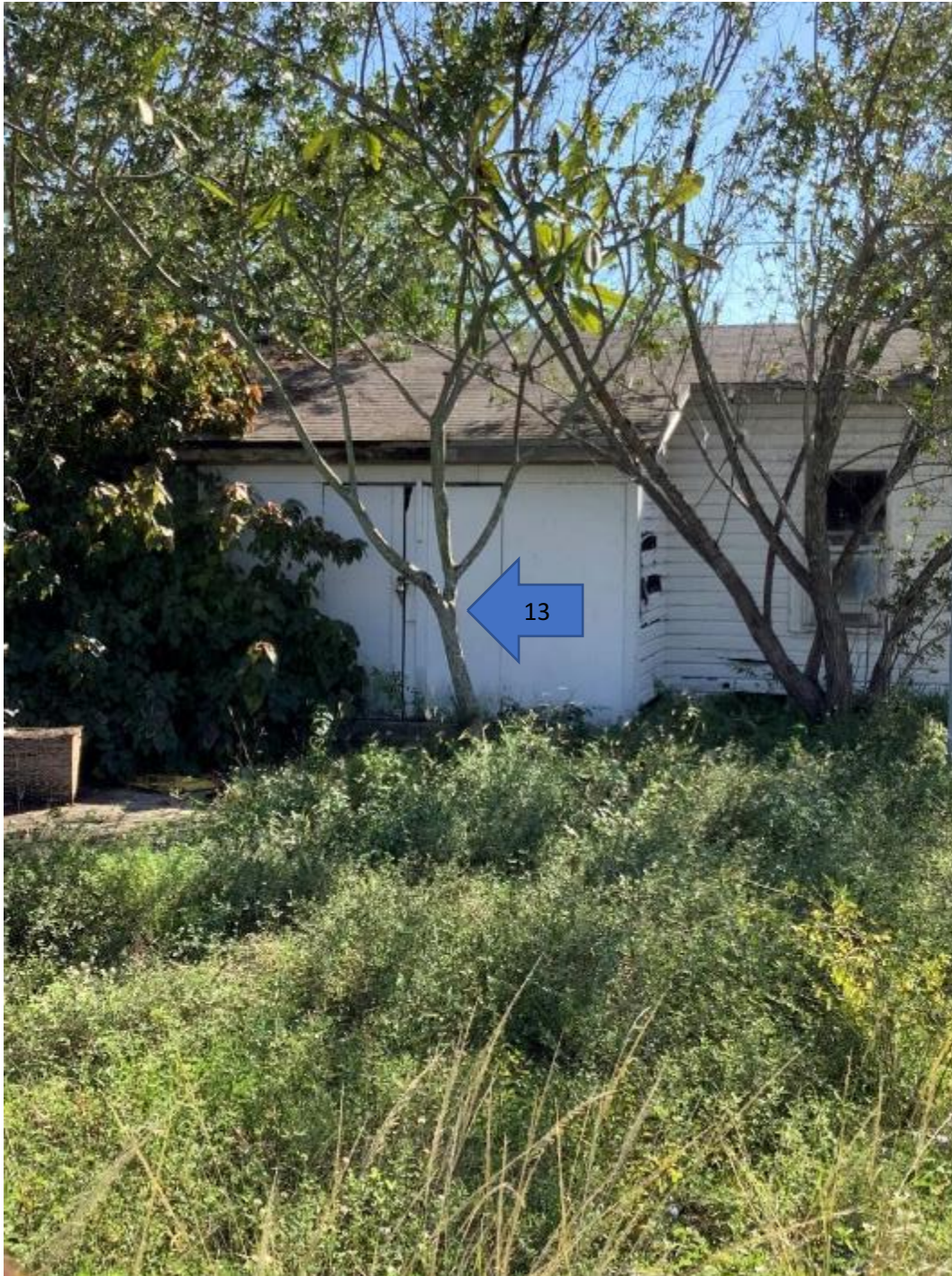
Frangi Pani ( Plumeria sp. ), facing south. Note canopy crowding.

Jeremy T Chancey, Consulting Arborist 1323 Southeast 17th Street, #201 Fort Lauderdale, Florida 33316 c 954 612 2500 jeremytchancey@gmail.com