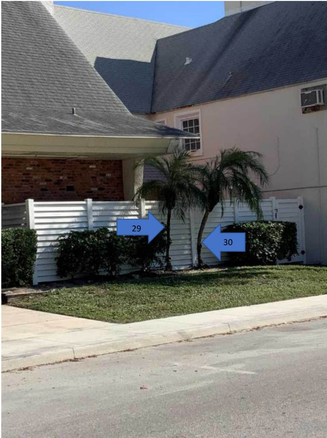
Pygmy Date Palms ( Phoenix roebelenii ), facing east. Note nutrient deficiencies for Tree #30.

Jeremy T Chancey, Consulting Arborist 1323 Southeast 17th Street, #201 Fort Lauderdale, Florida 33316 c 954 612 2500 jeremytchancey@gmail.com