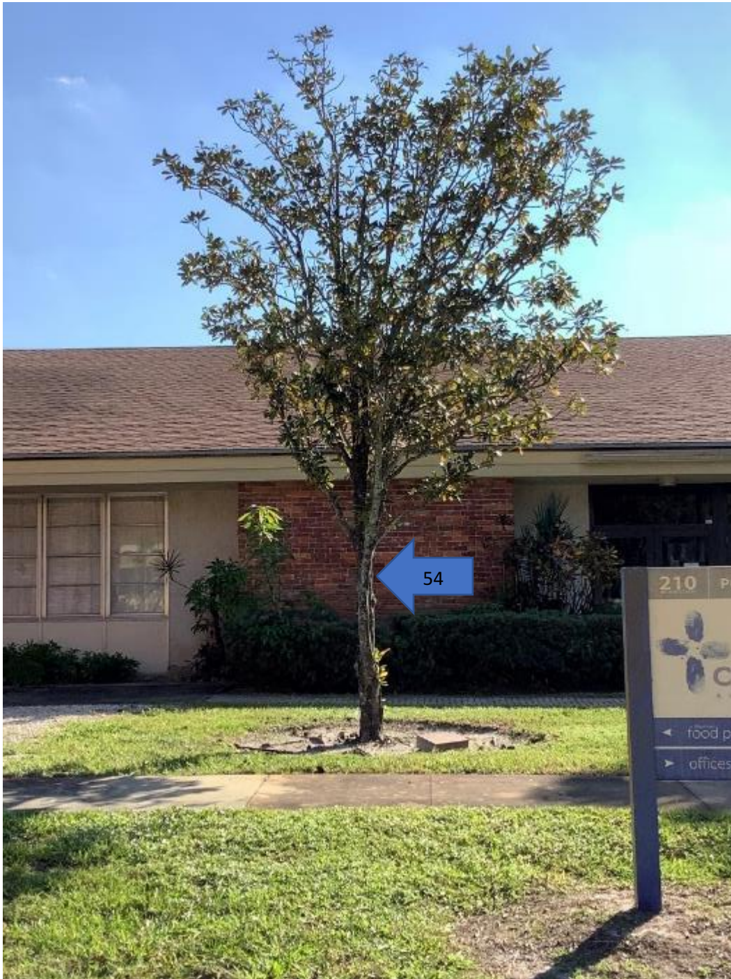
Magnolia ( Magnolia grandiflora ), facing south. Note canopy dieback and chlorosis.

Jeremy T Chancey, Consulting Arborist 1323 Southeast 17th Street, #201 Fort Lauderdale, Florida 33316 c 954 612 2500 jeremytchancey@gmail.com