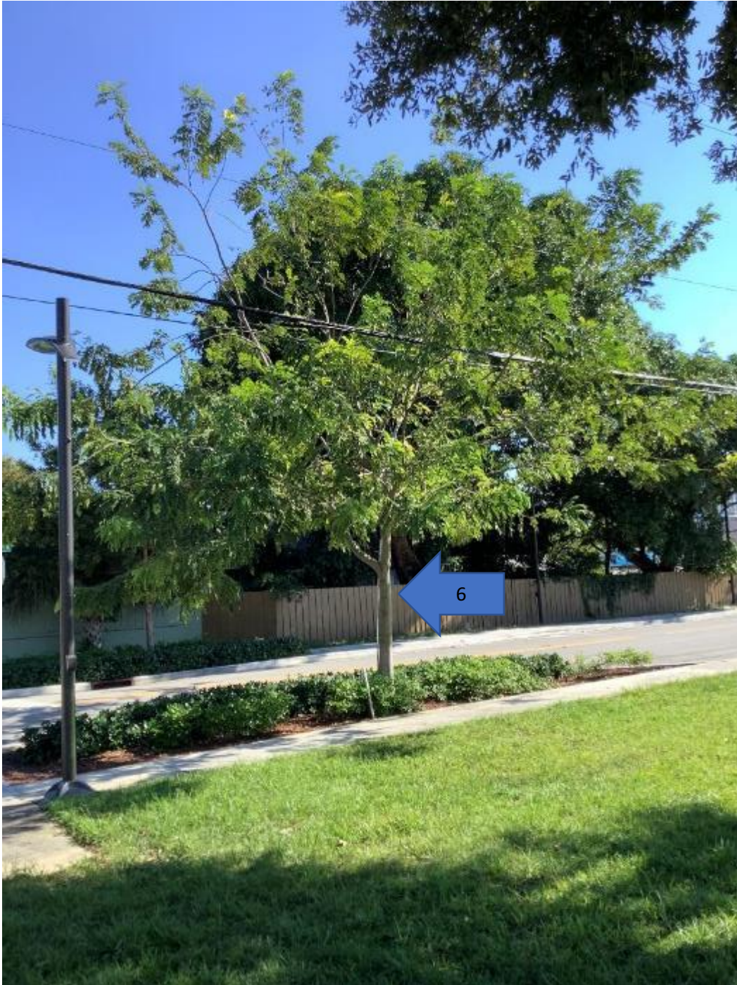
Pink Shower ( Cassia javanica ), facing east. Note nutrient deficiencies and old bracing pole.

Jeremy T Chancey, Consulting Arborist 1323 Southeast 17th Street, #201 Fort Lauderdale, Florida 33316 c 954 612 2500 jeremytchancey@gmail.com