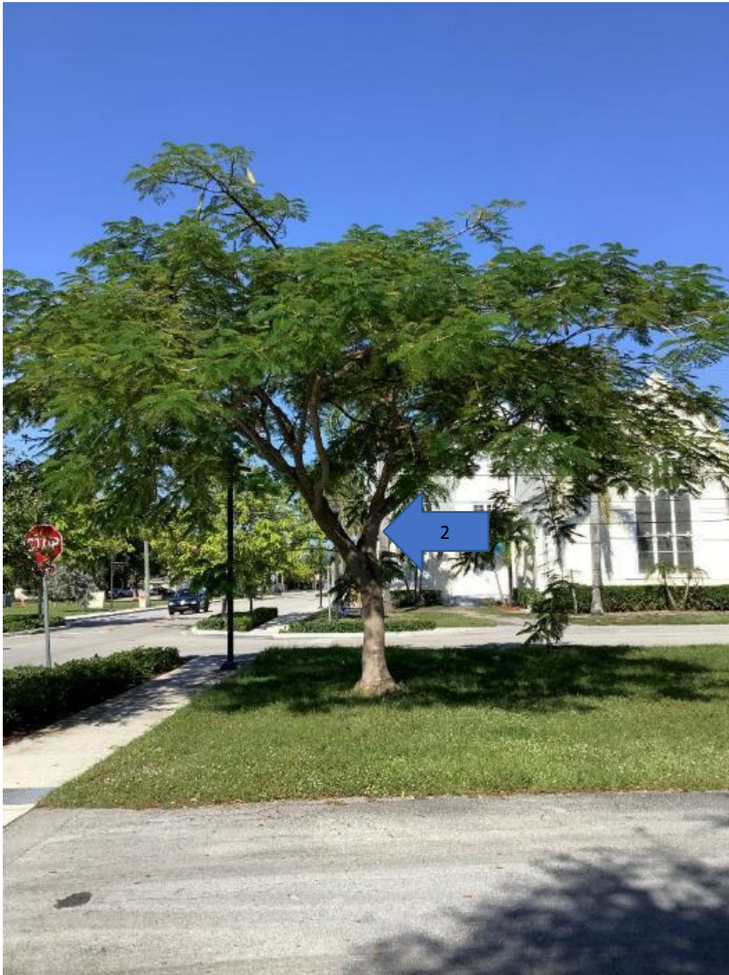
Royal Poinciana ( Delonix regia ), facing north. Note poor structure.