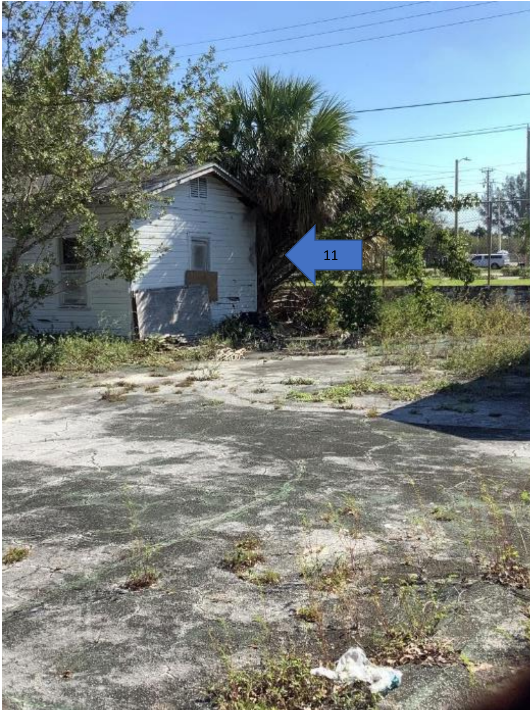
Sabal Palm ( Sabal palmetto ), facing south. Note confined root space.

Jeremy T Chancey, Consulting Arborist 1323 Southeast 17th Street, #201 Fort Lauderdale, Florida 33316 c 954 612 2500 jeremytchancey@gmail.com