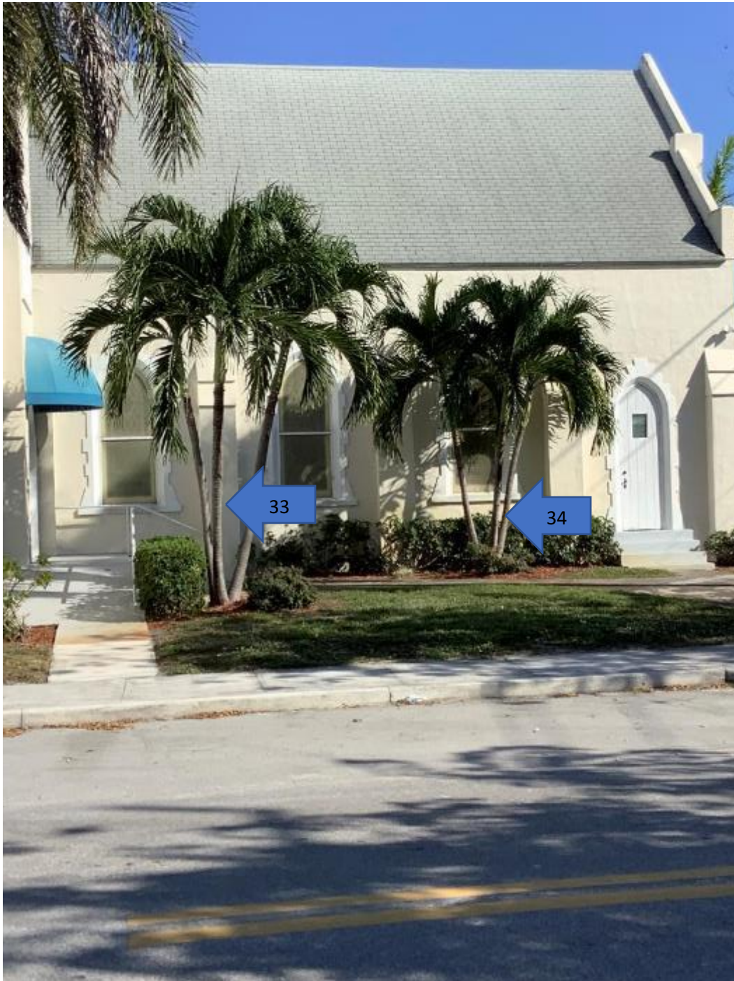
Christmas Palms ( Adonidia merrillii ), facing east.