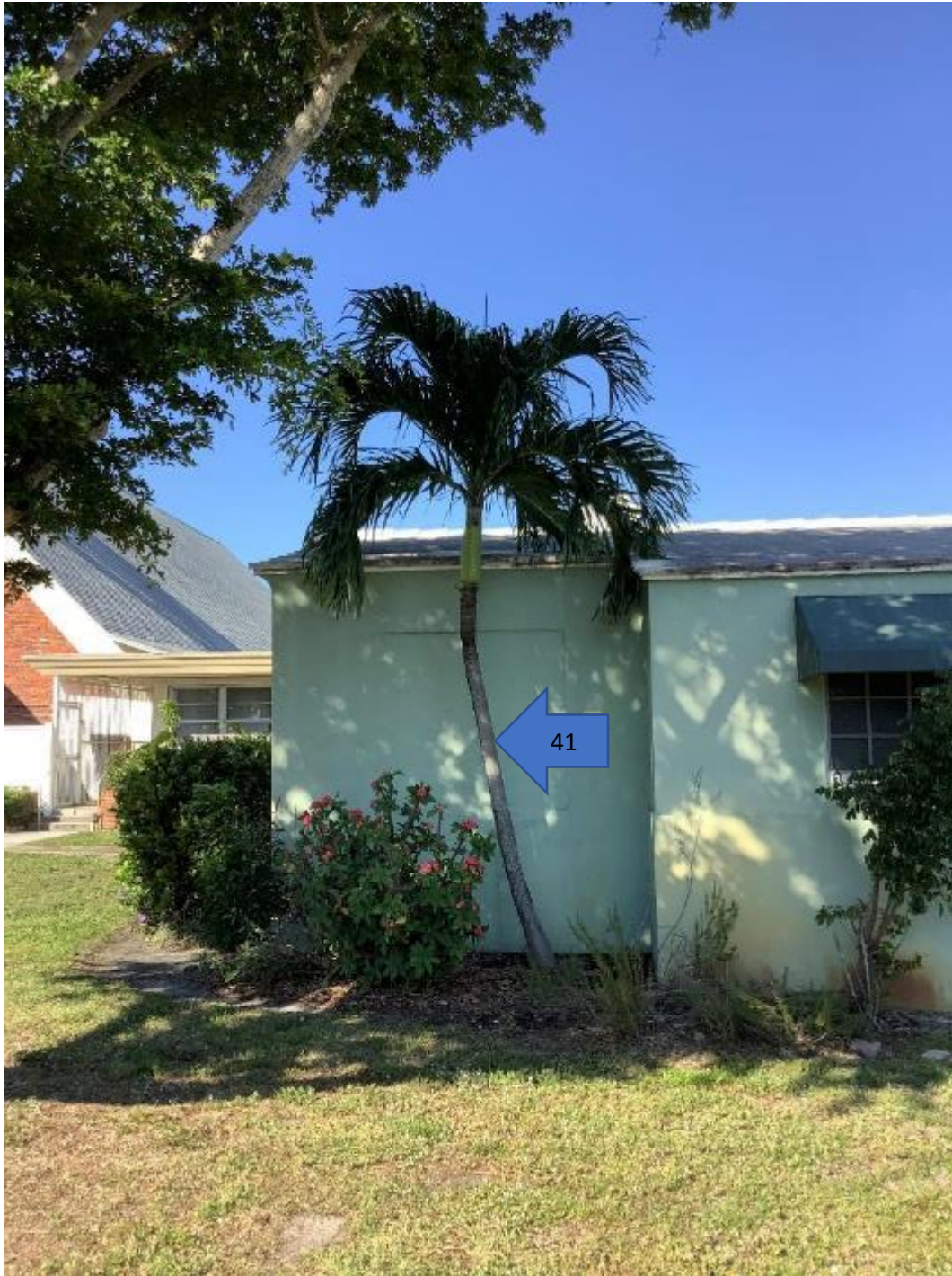
Christmas Palm ( Adonidia merrillii ), facing north.