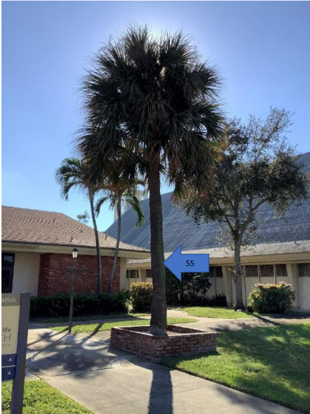
Sabal Palm ( Sabal palmetto ), facing south.