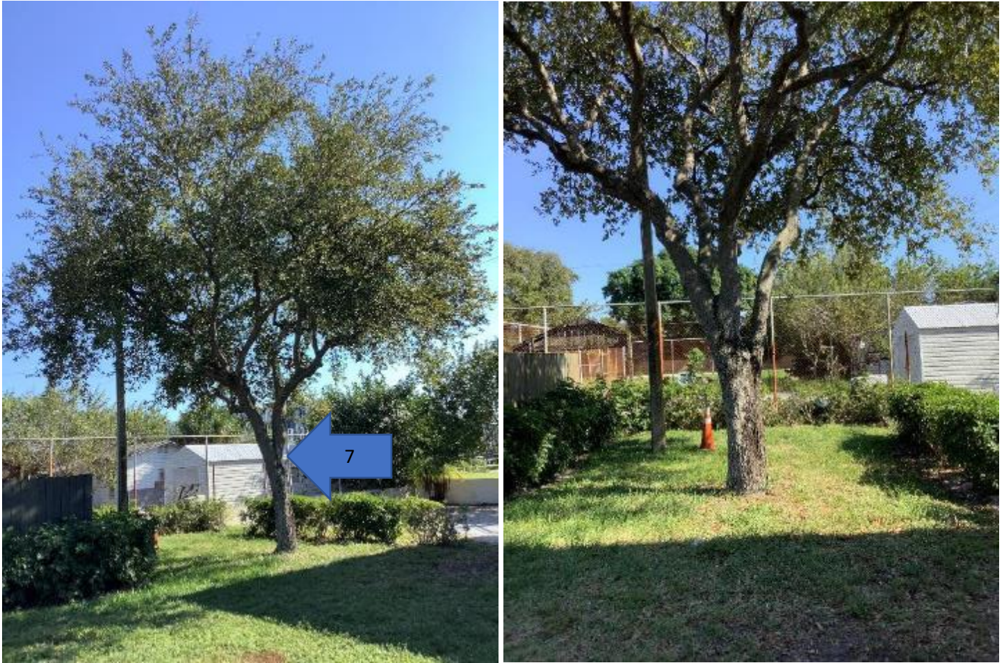
Live Oak ( Quercus virginiana ), facing east. Note poor structure and over lifted canopy.

Jeremy T Chancey, Consulting Arborist 1323 Southeast 17th Street, #201 Fort Lauderdale, Florida 33316 c 954 612 2500 jeremytchancey@gmail.com