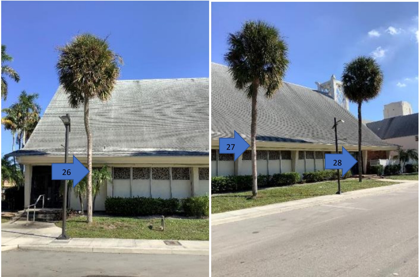
Sabal Palms ( Sabal palmetto ), facing east.

Jeremy T Chancey, Consulting Arborist 1323 Southeast 17th Street, #201 Fort Lauderdale, Florida 33316 c 954 612 2500 jeremytchancey@gmail.com