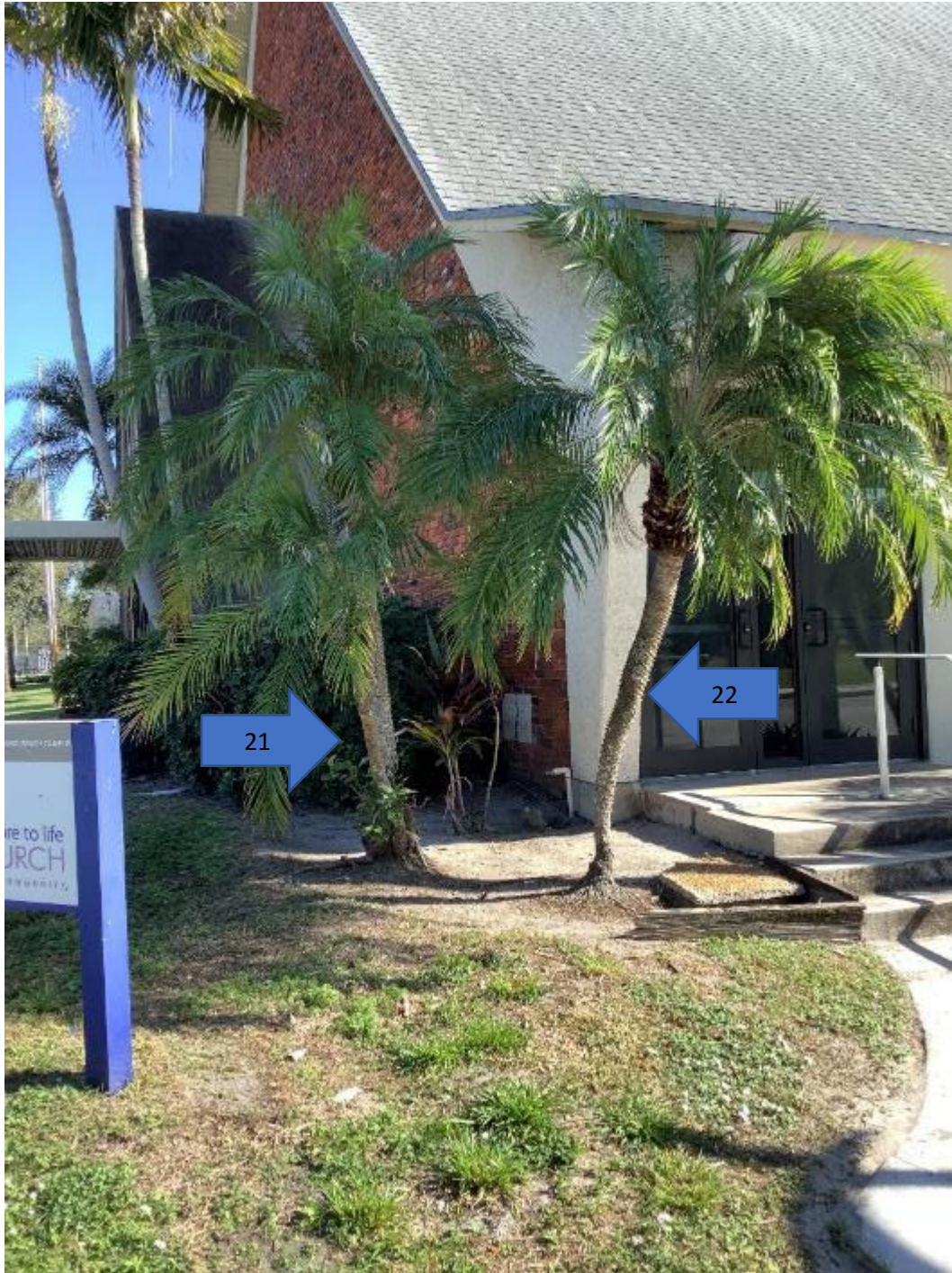
Pygmy Date Palms ( Phoenix roebelenii ), facing east. Note nutrient deficiencies.