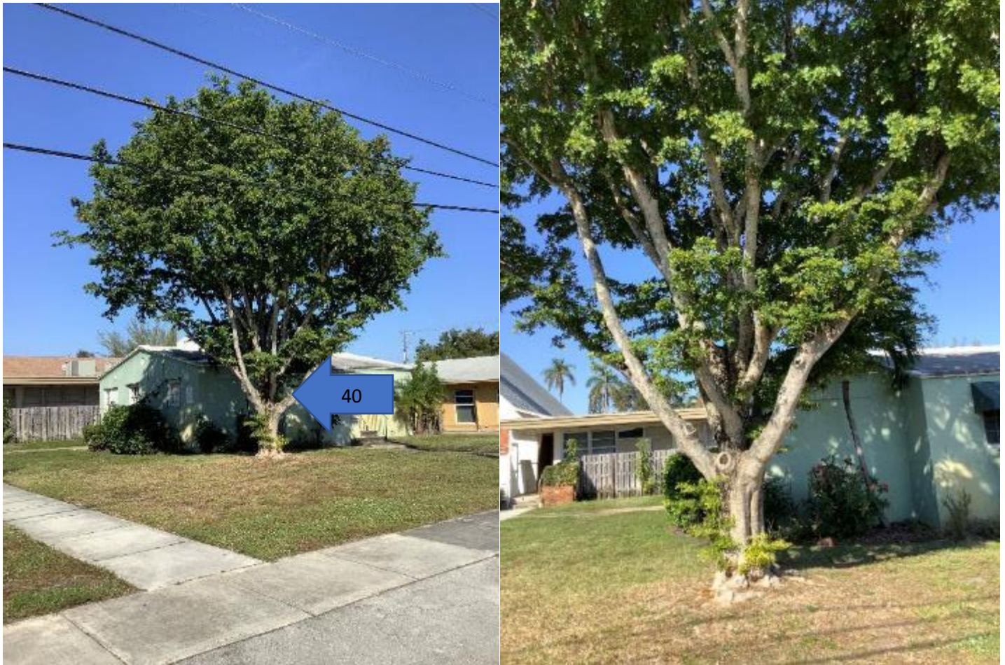
Black Olive ( Bucida buceras ), facing north. Note Poor structure, chlorosis, flush cuts, and confined root space.

Jeremy T Chancey, Consulting Arborist 1323 Southeast 17th Street, #201 Fort Lauderdale, Florida 33316 c 954 612 2500 jeremytchancey@gmail.com