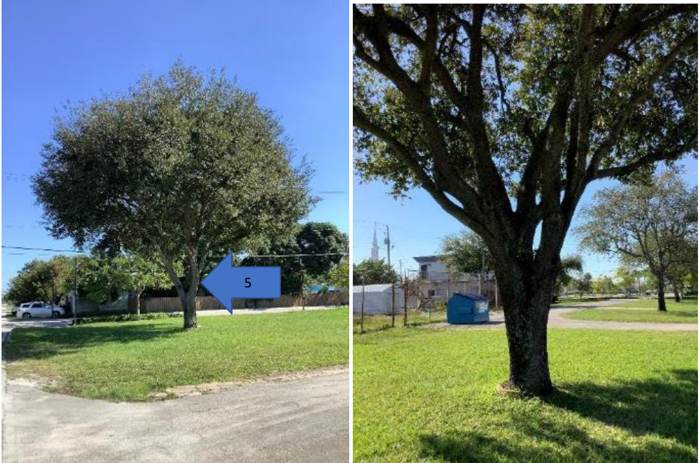
Live Oak ( Quercus virginiana ), facing east. Note poor structure, over lifted canopy, and flush cuts.

Jeremy T Chancey, Consulting Arborist 1323 Southeast 17th Street, #201 Fort Lauderdale, Florida 33316 c 954 612 2500 jeremytchancey@gmail.com