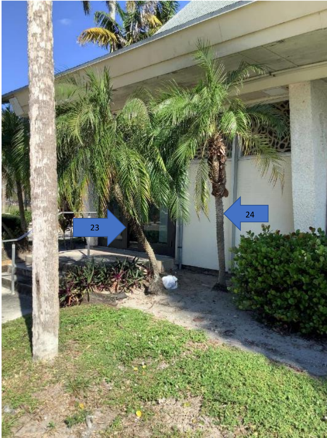
Pygmy Date Palms ( Phoenix roebelenii ), facing east. Note nutrient deficiencies.